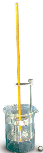
B072-20 + B072-02