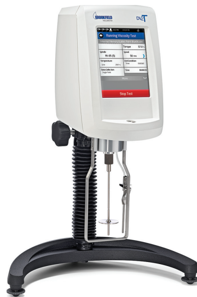
DV2T EXTRA™ Viscometer

The DV2T is available in a Wells/Brookfield Cone & Plate Version Must be ordered when instrument is first purchased.